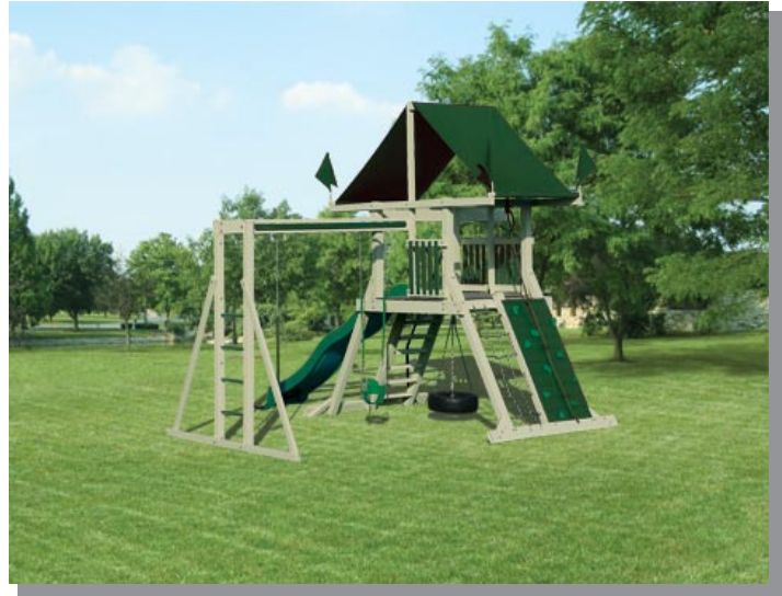
The new playground system will have a similar look.

Over the last 12 months the condition of the current playground equipment has deteriorated to an unsafe condition. The board was approached to investigate and select an upgrade for both safety and a curb appeal for the community. The Board is sure the families will be excited and pleased by this new, very attractive, functional and safe upgrade to our community.